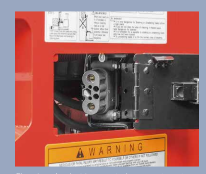
Charging plug inside operator's compartment, this eliminates the need to disconnect the plug from battery, enhancing ease of operation (Std.)