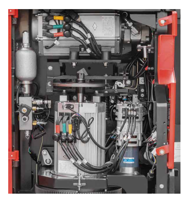
The loading wheels with hydraulic braking make the braking distance shorter and safer