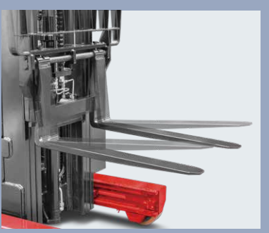
Forks can tilt forward/backward for easy loading