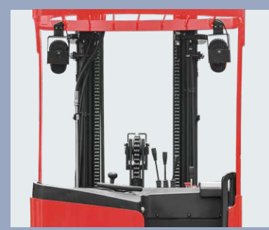
New designed mast and the large open stee