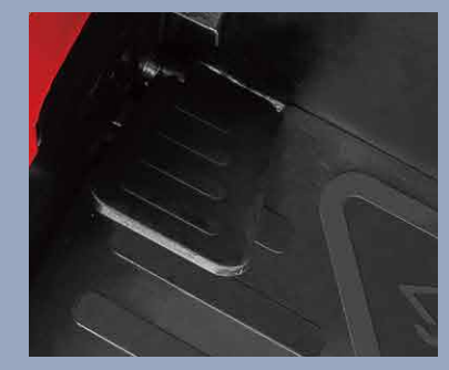
Safe pedal: when the pedal is released, traveling is stopped, and only hydraulic operation is enabled